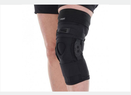
CROSS Semi-Rigid Knee Orthosis