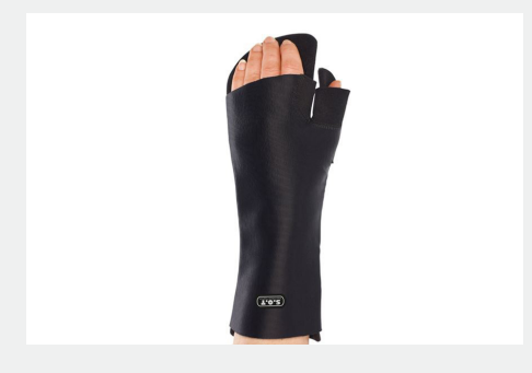
S.O.T - Resting Hand Splint