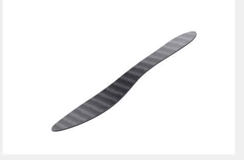
Allard Carbon Footplate