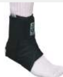
ASO Ankle brace