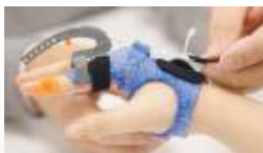
Dynamic orthosis with Isoforce