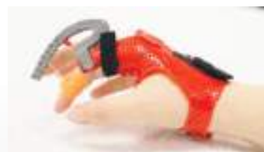
Dynamic orthosis with Isoforce